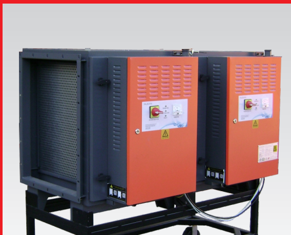
BS-216Q 4000 Clean Technology Filtration System